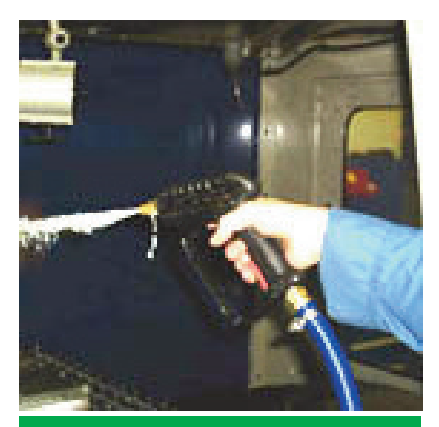
Coolant being discharged