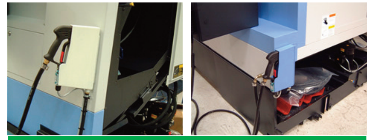
The pictures above show different mounting options