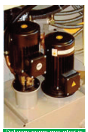
Delivery pump mounted in coolant tank

The wash gun is an accessory which can be fitted to most CNC machine tools. The Pumps and Equipment option comes as a complete retro-fit kit, which includes all all electrical and mechical parts required for the installation. The unit can be supplied on its own, or fitted by our expert engineers upon request. The design is fully automatic and operates when the gun is removed from the holster, thereby energising the delivery pump. Upon depression of the trigger, collant is discharged (see Fig. 2). The holster is typically located close to the machine door (Fig. 3) and in easy reach for the operator. With most paint colours available, the gun holster and pump plate modifications are able to complement any CNC machine tool. Pump Plate modifications are available upon request but are not part of the standard kit.